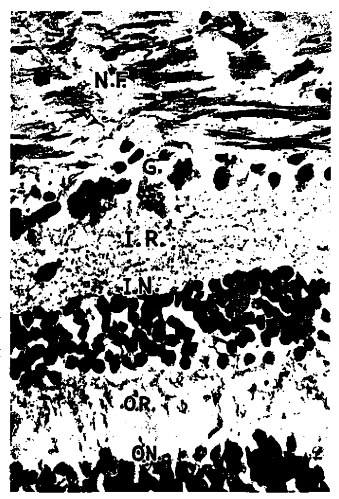
Fig. 2.—Photomicrograph of the retina in acute poisoning from methyl alcohol, showing the general edema, especially in the nerve fiber layer, N.F., and in the ganglion cell layer, G. Note the pyknosis and eccentric wandering of the nuclei and the wide separation, as well as the cytoplasmic fraying, of the cells. I.R. indicates the inner reticular layer; I.N., the inner nuclear layer; O.R., the outer reticular layer, and O.N., the outer nuclear layer.

Eyes.—In almost every one of the bodies the eyes were closed by the embalmer, so that their appearance was not noted at autopsy. However, one eye was removed from each body. Except for variations in the amount and in the edema of the retro-orbital fat, no noteworthy changes were observed about these eyes. They were placed in solution of formaldehyde and were later opened to complete the fixation. The retinas were found to be intact, grayish white and slightly